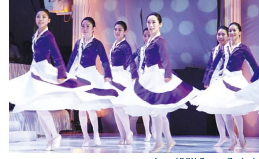
from "GCN Power Praise"

The kind of praising with which God is pleased drives away darkness, brings forth solutions to various problems in our lives, and, as our spirits prosper, allows us to receive His answers and blessings Therefore, the praise we offer God must be a confession of our faith stemming from the depths of our heart and by the love God pours upon our spirits, our lives become prosperous both in spirit and in flesh.