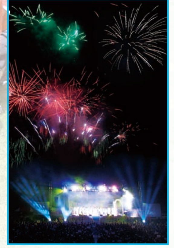
A flame of hope launched while affirming unity

We give all thanks and glory to God for pouring His overflowing grace in spirit and in flesh through "The 2008 Summer Retreat."