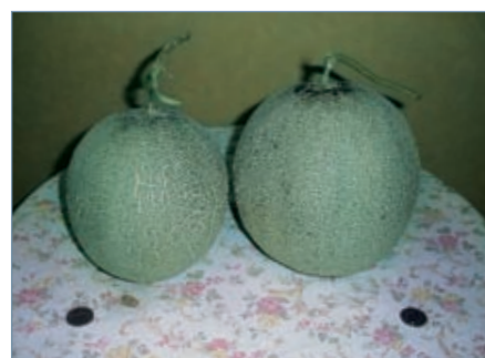
The melon on which the Muan Sweet Water was used (right)

My sister-in-law, a farmer in Buyeo County in South Chungcheong Province, attends another church but has been listening to the Senior Pastor's messages via GCN and on the Internet.