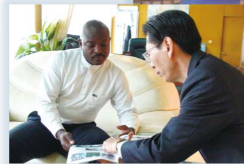
Introducing Manmin to President Nkurunziza