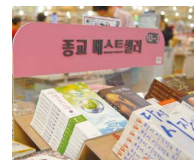
Spirit Soul and Body became bestseller at the Religion section of Kyobo Bookstore.