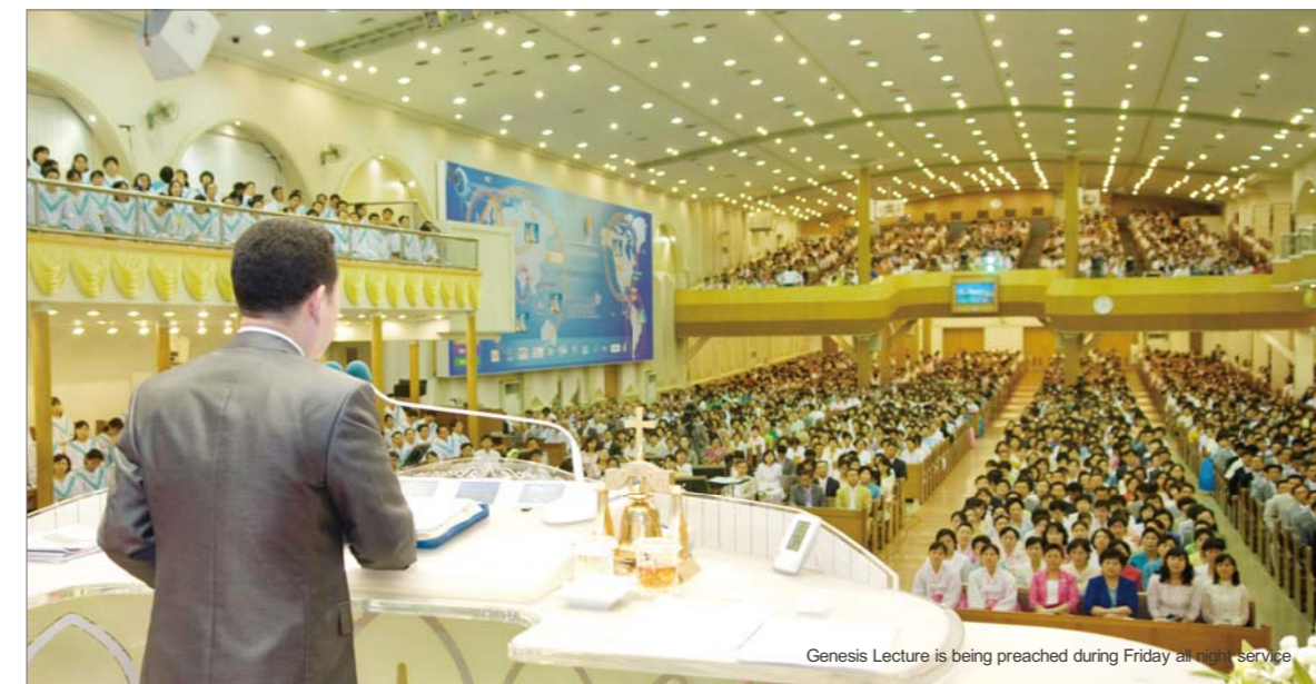
Genesis Lecture is being preached during Friday All Night Services

Beginning at 11 PM every Friday night in the 'Friday-all-Night' service of Manmin Central Church, wonderful messages about God's providence of creation and human salvation are being preached. On June 26th, after the Revelation lectures which was finished after 3 years, the second lecture series on the book of Genesis started with the first message titled "God the Origin."