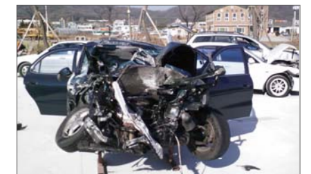
▲ His car severely damaged after the accident