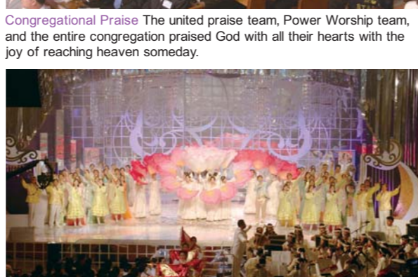
Finale Praising God's majesty and greatness, and celebrating God the Father for accepting all the fruits of heaven by Joint Singing Team, United Choir & Nissi Orchestra