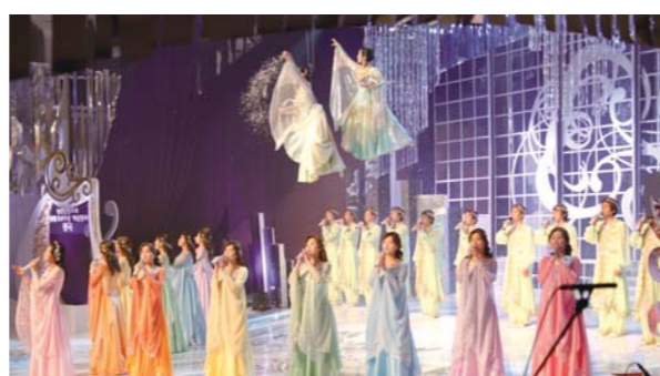
Confession The united praise team reflects God's children offering praises of thanksgiving for His love that led them all the way to New Jerusalem, the most glorious place in heaven.