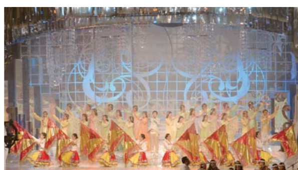
Congregational Praise The united praise team, Power Worship team, and the entire congregation praised God with all their hearts with the joy of reaching heaven someday.