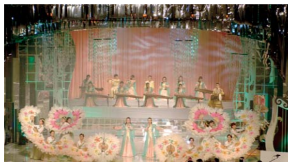
The Heavenly Feast Serem Korean Traditional Music Team and Performing Arts Dance Team expressed the beauty of heaven and their joy of becoming heavenly citizens with Korean traditional instruments and dances.

God created the world with beautiful lights. His great power cannot be done by anyone else. Works of creation are possible only by God the Trinity. When He said, "Let there be light," there came to be light. He made the expanse, and let the earth come into existence. He said, "Let the earth sprout vegetation, plants yielding seed, and fruit trees." He created lights in heavens to separate the day from the night. He let the earth bring forth living creatures. Then He formed man, whom He loved. Such is the great love of God the Father That no one else can emulate. The Lord is worthy of receiving praises. His name is praised forever and ever. His redeeming love cannot be given by anyone else. He loved His people until His last moment on earth. He redeemed mankind from their wickedness. He is the beautiful Son of the Father God. He is to be honored and glorified forevermore. The true Son of the Father manifests fiery works of the Holy Spirit. He intercedes for the weakness of mankind with tearful prayers. He vindicates for the defects of many souls. Until He leads many souls into the beautiful kingdom, He earnestly offers up prayer after prayer with many tears. His prayers become touching incense to the heart of the Father. He has borne many fruits and glorified the Father. With His righteousness, love and earnest mercy, He prayed to the Father with thanksgiving and gave all the glory to the Father. He is the beloved Son of the Father. He is the original heart of the Father.