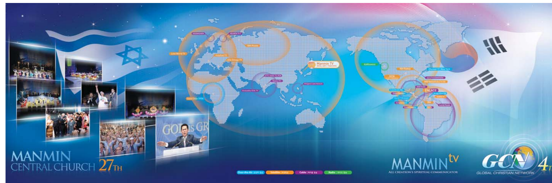
GCN-Manmin TV is broadcast 24 hours a day in Asia, Africa, Europe, and the Middle East through NSS6, ABS1, and THAICOM5. And the same programs are also broadcast in Russia, Europe, Asia, North and South America, and Israel through GCN TV, RBN-Rodney and TBN-Russia.