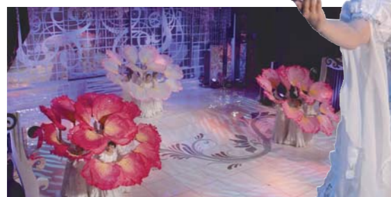
Dancing of Angels The Joint Dance Team expressed God's providence of creation and His love with flower-shaped fans in beautiful costumes by dancing to beautiful, heavenly music.