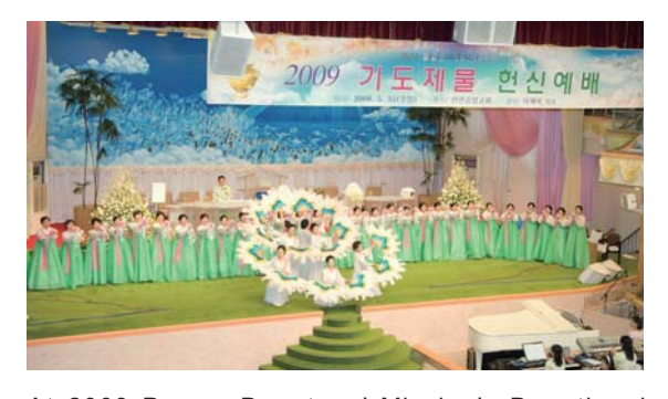
At 2009 Prayer Devotees' Mission's Devotional Service held on Sunday, May 31, representatives of devotees were glorifying God with special songs.

Even today, all the prayer devotees are crying out in prayer without changing for the kingdom of God.