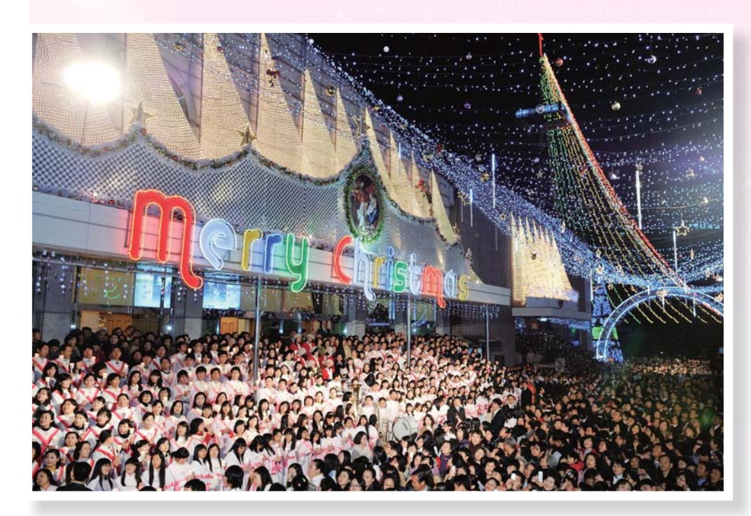
On last December 11, there was Christmas Lighting Ceremony in front of the main sanctuary of Manmin Central Church.

Our church's Christmas tree is gaining attention from passers-by as well as neighbors. The tree was decorated with 12 hundred thousand LED's, neon lights and light bulbs.