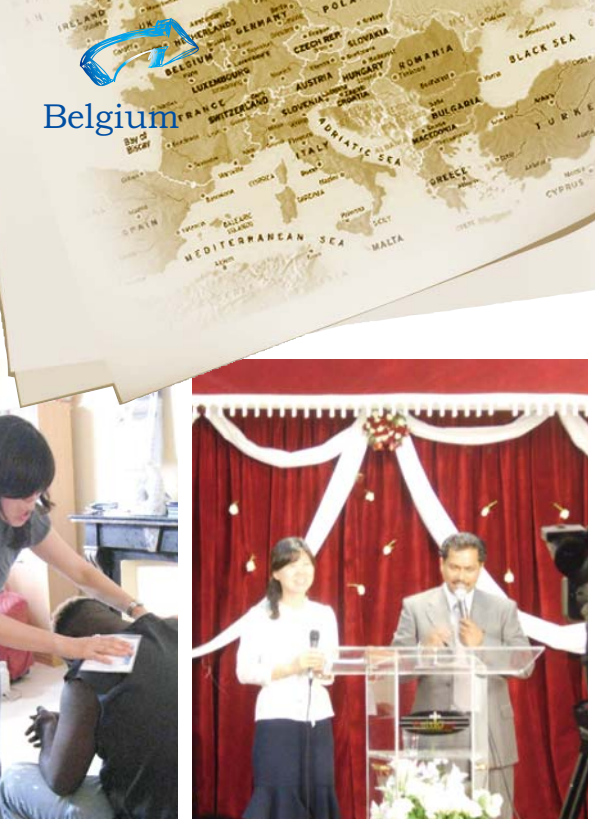
Visited a brother who Preaching a live sermon at HolyGod TV was healed of drug of France addiction and administered

European mission network is steadily being entire service was over. Witnessing this, I felt established