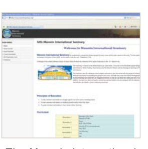
The Manmin International Seminary (MIS) website

The headquarters of MIS is located in Seoul and it has campuses in Belgium, UK, Russia, India, China, Taiwan, US, Peru and so on. The students can also listen to the online lectures. If you log on to MIS website at www.manminseminary touched by understanding and fill out the form, the 2009.