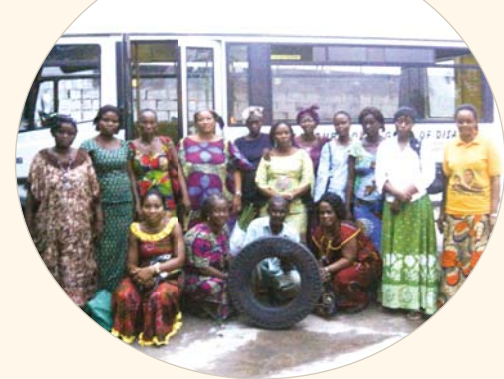
Members of Kinshasa Manmin Church who were protected in the van whose two wheels went flat