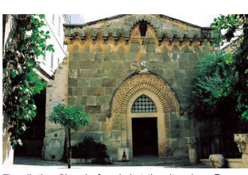
Flagellation Church, founded at the site where Romans soldiers floaged Jesus (John 19:1-3)