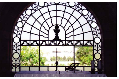
Catholic Dominus Flevit Church, which in Latin means "the Lord wept" (Luke 19:41-42)