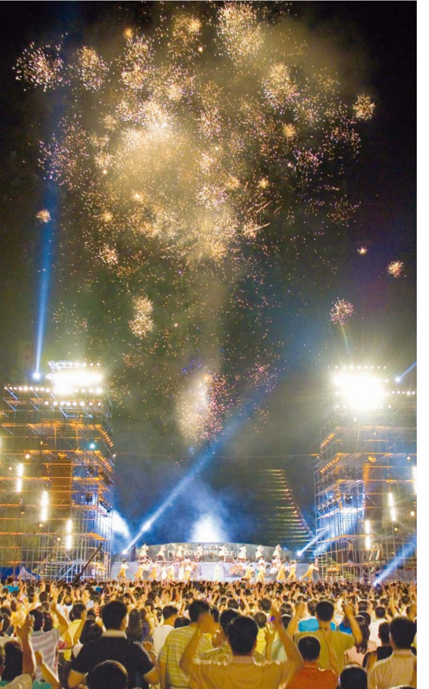
programs including spiritual messages, prayer, praise, and fellowship and the worldwide festival with brothers and sisters from overseas branch churches.

In Korea, the vacation season is of the fervent hope for the city of coming, while members of Manmin Church are awaiting a chance of God's special grace. The chance is the summer retreat of the church. At the summer retreat, the members experience biblical wonders and signs in the nature, God's creatures, improve their spirituality, and become filled with the Holy Spirit by the Word of God and prayer. This summer retreat is annually held in the late July and the early August. Through the summer retreats, members of each mission come to have the assurance