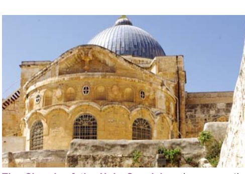
The Church of the Holy Sepulchre, known as the Church of the Resurrection (John 20:1-8)