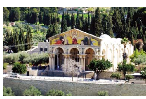
Church of All Nations, which was founded at the Mount of Olive (Luke 22:44)