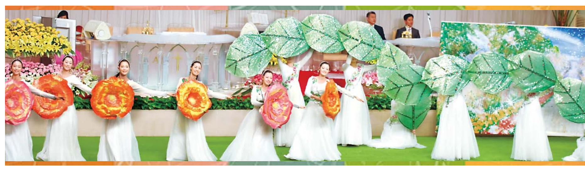
At the Sunday evening service offered on September 5, 2010, the Artistic Dance Mission Team expressed the beauty of Heaven, our sweet memory of earthly life and gratitude for the love of God with beautiful fan dance to the music 'Beautiful Hope'.

The Performing Arts Committee consists of 5 choirs, the Nissi Orchestra, 25 praise teams, and 16 soloists. The Committee serves the worship services, healing crusades, Christian meetings and events with praise, dance and various performances. They lift up praise and give glory to God through high class Christian performances.