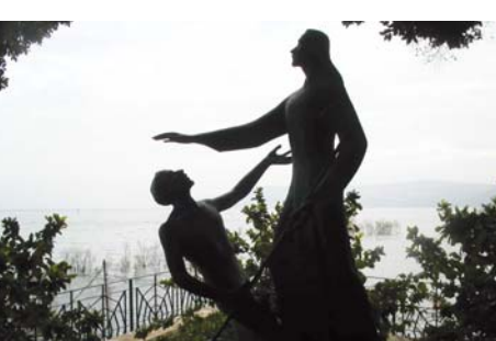
The Church of the Primacy of St. Peter