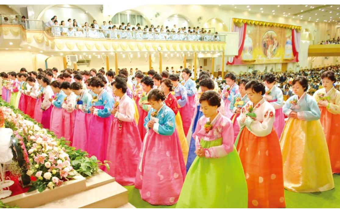
groups to the lower altar to be inaugurated and greet to the audience.

service to God and pledged to faithfully perform their duties and responsibilities to fulfill the visions given by God during this 'Third Stage of Take- off of the Church'.