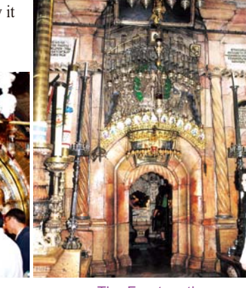
Station of the Cross the place where Jesus was laid in the tomb prepared by Joseph Arimathea