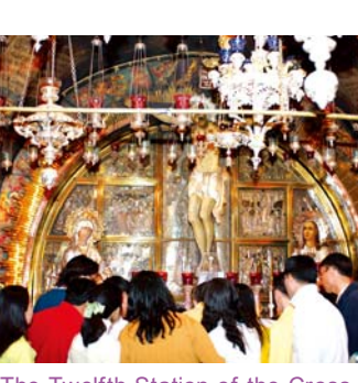
the place where Jesus died on the cross