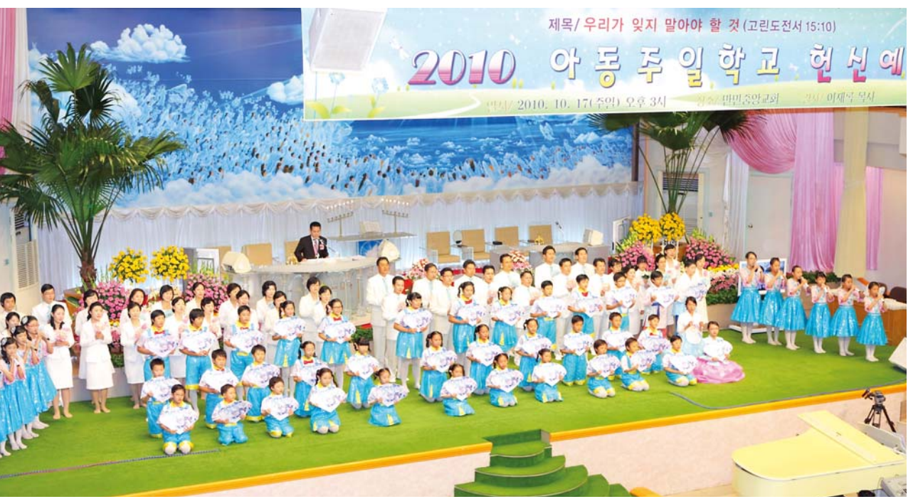
Representatives of each group of children's Sunday school are offering special songs at the devotional service. Children's pure and innocent songs and their sincere attention to the message touched the heart of many people.

Professed Children of Manmin at the 2010 Children's Sunday School Devotional Service