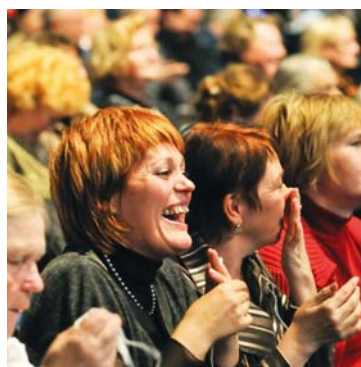
The Estonian Miracle Healing Crusade was recorded as a Christian event with the most attendees (Saku Suurhall Arena)