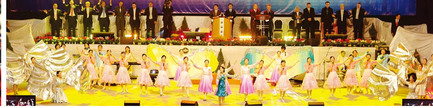
The performance team of Manmin Central Church sang songs in Estonian, English, and Russian and their excellent Christian Cultural performance raised the audience's great joy and emotion