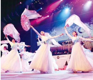
Heaven-like beautiful dances impressed the audience greatly