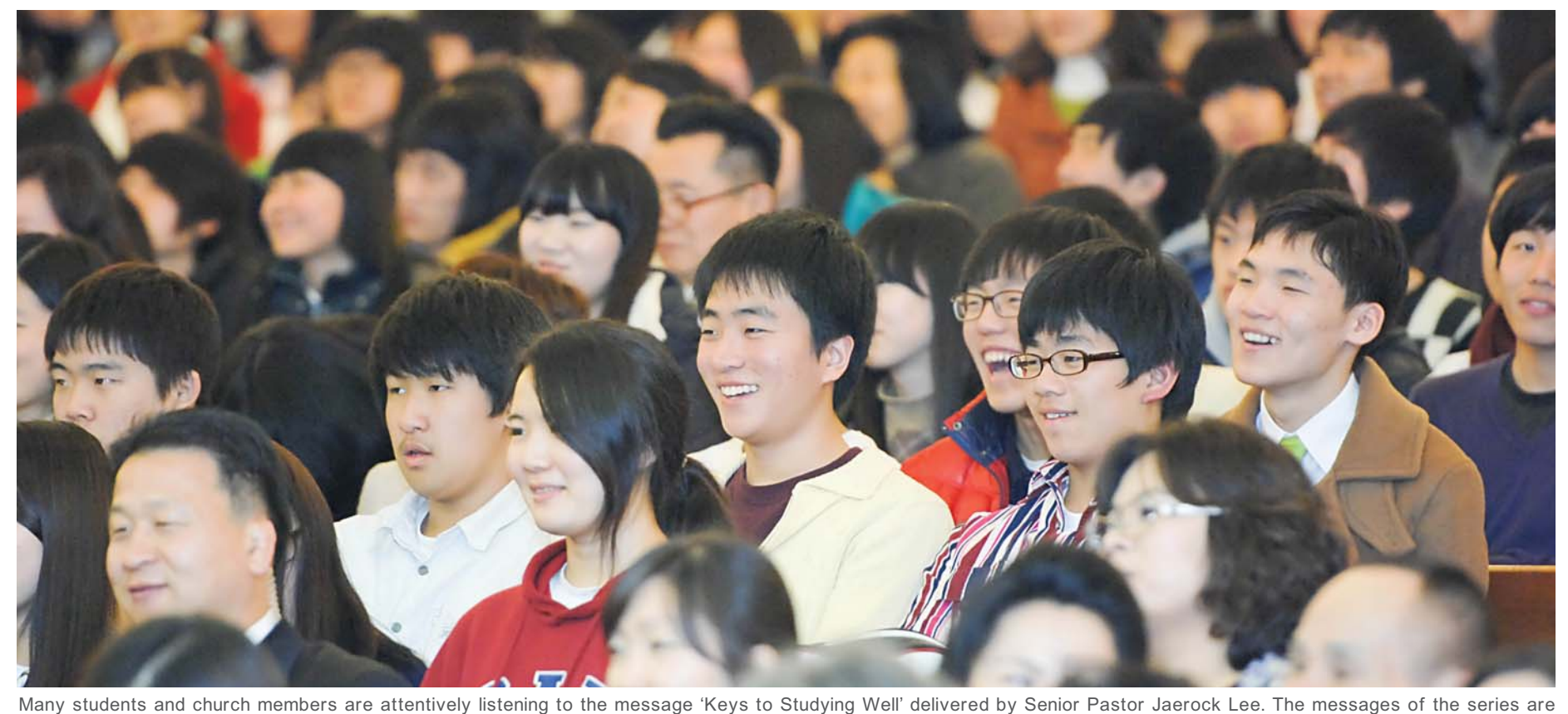
useful for their studying, employment examinations, promotion examinations, but above all else, they are for the improvement of their faith.

from the Sunday Sermon Series as a Shortcut to Success