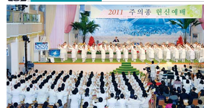
The pastors were singing special songs to God at the Pastors Devotional Service they offered on January 9, 2011.