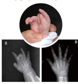
Before prayer After prayer (5 months old, (37 months

My wife and I were so shocked that we fasted and prayed for our son, but there was no difference. I suggested to my wife that we stop watching TV and shopping online. To be honest, I had been immersed in online gaming and my wife in online shopping. I had hardly prayed for 2 years and did not keep the Lord's Day holy, but