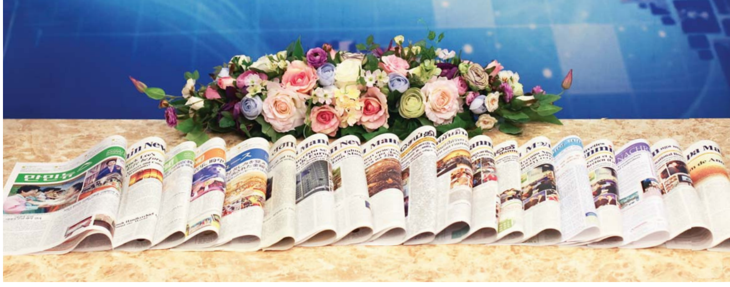
Manmin News in 20 languages is being distributed and leading countless souls to the way of salvation in Africa, Europe, the Americas, and Asia

The 24<sup>th</sup> Anniversary of Manmin News , which has been published in 20 languages