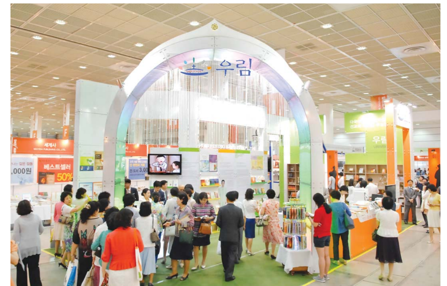
Urim Books is spearheading the world mission as a member of Evangelical Christian Publishers Association (ECPA), Christian Booksellers Association (CBA), and Korean Publishers Association.