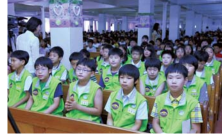
"We are serving with love and humility."

Tel: 82-2-818-7334 Fax: 82-2-830-3310 www.manminseminary.org e-mail: manminseminary2004@gmail.com