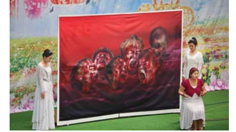
"I am so scared of Hell."