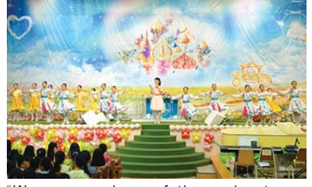
"We are members of the praise team. worship team, and dance team of Children Sunday School.