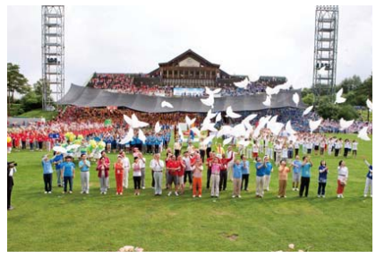
2011 Manmin Summer Retreat in Deokyusan Resort in Muju, Jeonbuk