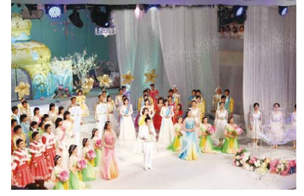
The 29th Anniversary Celebration Performance of Manmin Central Church