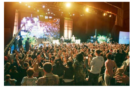
The 2<sup>nd</sup> Israel United Crusade with Dr. Jaerock Lee (International Convention Center in Haifa)