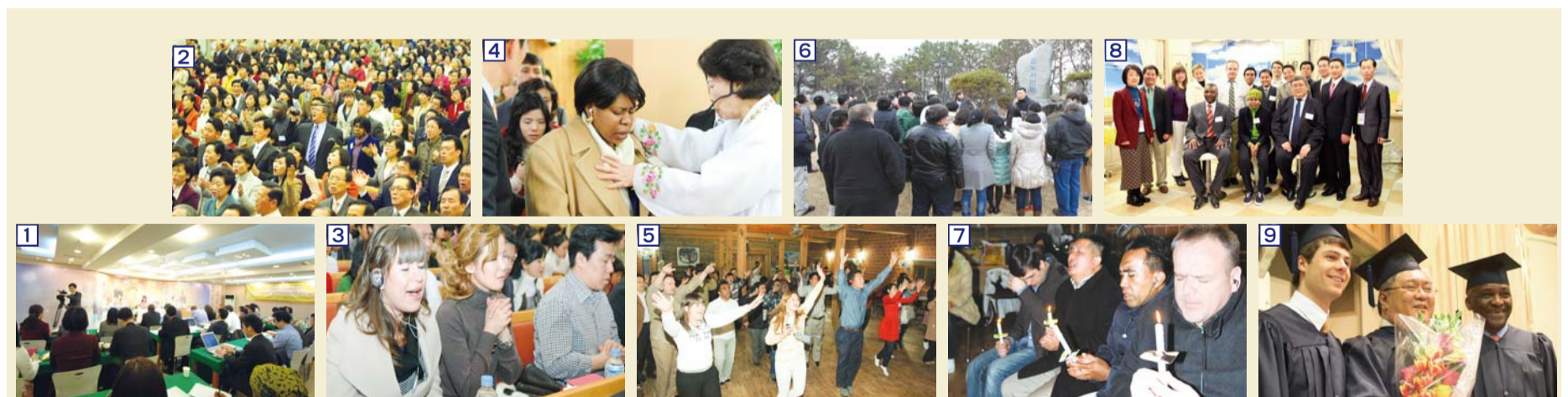
They said they wouldn't forget the 25-day journey in Korea forever. ■ Photo 1: Lectures ■ Photo 2: Friday All-night Service ■ Photo 3: Daniel Prayer Meeting ■ Photo 4: Divine Healing Meeting at the Manmin Prayer Center ■ Photo 5: Praise and Prayer Time at the Muan Sweet Water Site ■ Photo 6: Spiritual Experience on Muan Sweet Water Hill ■ Photo 7: Praise and Determination Time at the Muan Sweet Water Site ■ Photo 8: Visit to GCN TV ■ Photo 9: Course Completion Ceremony on February 26

I am a praise leader in my church. Naturally, I received a lot of grace when speakers from the Performing Arts Committee gave lectures on praise, dance, and props. I videotaped the lectures and special performances during services. By using what I learned here, I want to offer up the Lord-pleasing praise as a praise leader and spread the holiness gospel. This program was a great blessing to me.