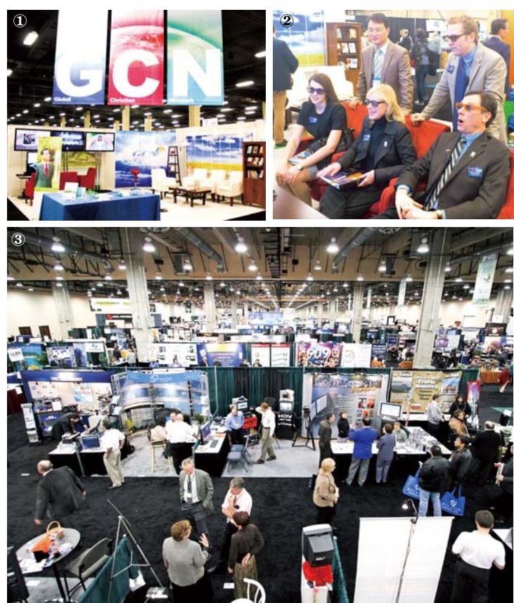
GCN Broadcasting has broadcasted the Word of life, God's powerful works, and high-quality Christian culture to 170 countries. ■ Photo 1: GCN Broadcasting's booth in 2012 NRB Convention and Exposition ■ Photo 2: NRB leaders watching 3D video presentation ■ Photo 3: Full view of 2012 NRB Convention and Exposition

the world together, establish infrastructure that enables people to watch the programs anywhere, and build a multilingual system and global distribution network."