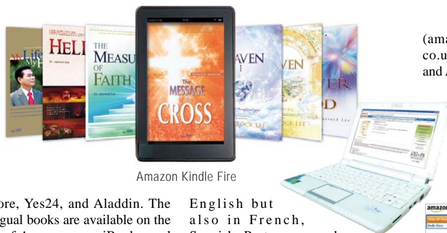
Amazon Kindle Fire