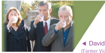
◀ David Waisman (Former Vice President of Peru, on the right)

Inscription on Muan Sweet Water Monument