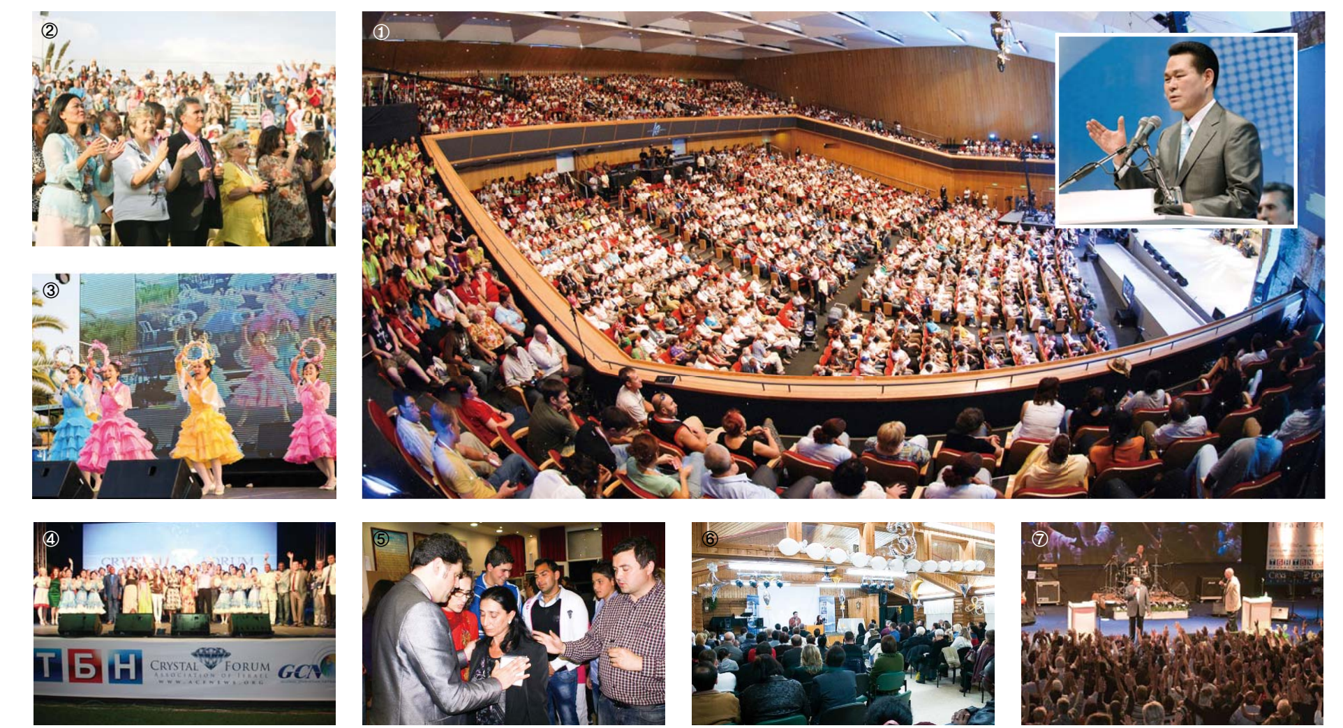
Photo 1: Israeli pastors received new strength after 2009 Dr. Jaerock Lee's Israel United Crusade and came to boldly proclaim Jesus Christ Photo 2: The 2012 Crystal Music Festival held on May 19 Photo 3: The performance given by Passion Chorus of Manmin Central Church Photo 4: Organizing members and performers in 2012 Music Festival Photo 5: Pastor Daniel Rozen, Representative of Crystal Forum, is praying for the sick with the handkerchief of power around the world Photo 6: Crystal Forum's 3rd Anniversary Event held in December in 2011 Photo 7: The 2nd Commemorative Conference of Dr. Jaerock Lee's Israel United Crusade held in October in 2011 (Speaker: World Revivalist Dr. Morris Cerullo)

Fire of Revival Set Ablaze in Israel by the Works of the Spirit