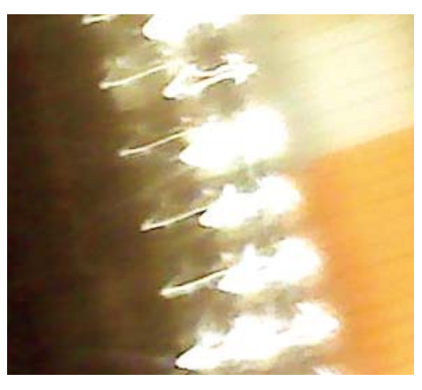
"As the appearance of the rainbow in the clouds on a rainy day, so was the appearance of the surrounding radiance. Such was the appearance of the likeness of the glory of the LORD. And when I saw it, I fell on my face and heard a voice speaking." (Ezekiel 1:28)

"And He who was sitting was like a jasper stone and a sardius in appearance; and there was a rainbow around the throne, like an emerald in appearance." (Revelation 4:3)