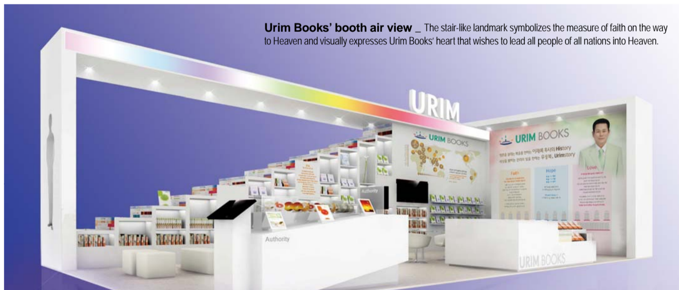
Urim Books' booth air view _ The stair-like landmark symbolizes the measure of faith on the way to Heaven and visually expresses Urim Books' heart that wishes to lead all people of all nations into Heaven.

Its opening hours are as follows: 9 A.M. to 6 P.M. on June 20 (Wed.); 10 A.M. to 6 P.M. on June 21 (Thurs.) to 22 (Fri.); 9 A.M. to 8 P.M. on June 23 (Sat.); and 10 A.M. to 5 P.M. (Sun.)