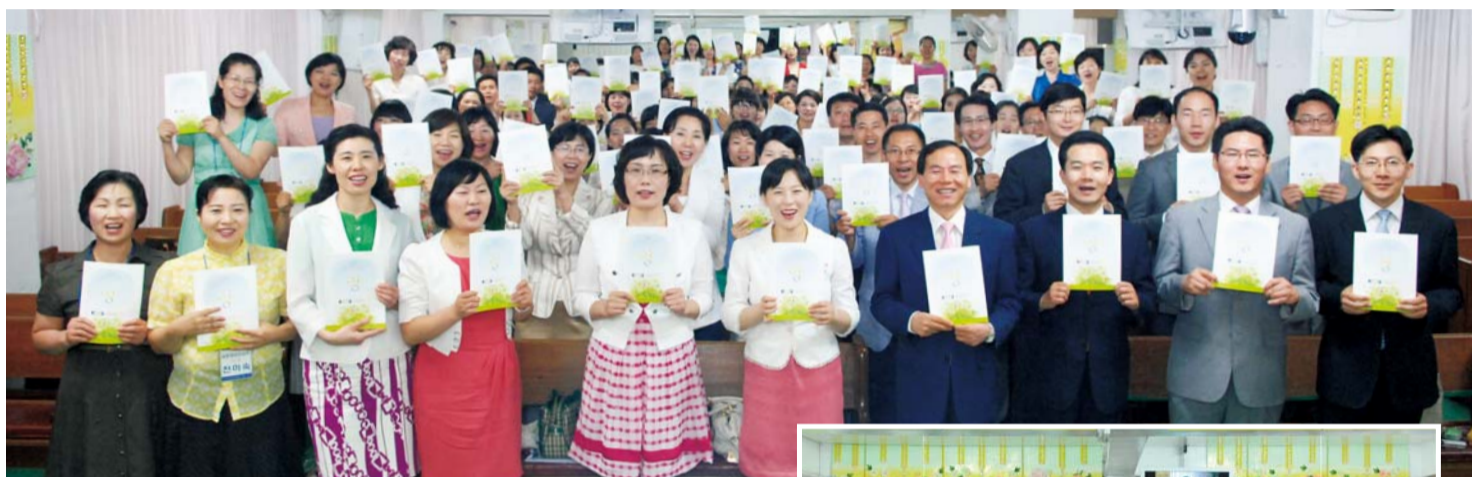
Headmasters and Teachers of Sunday School at the 2012 Conference for Teachers. They made up their minds to become teachers who can guide their students in a way that is balanced between spirit and body.