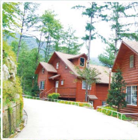
Students: Hwangdun Youth Center in Wonju