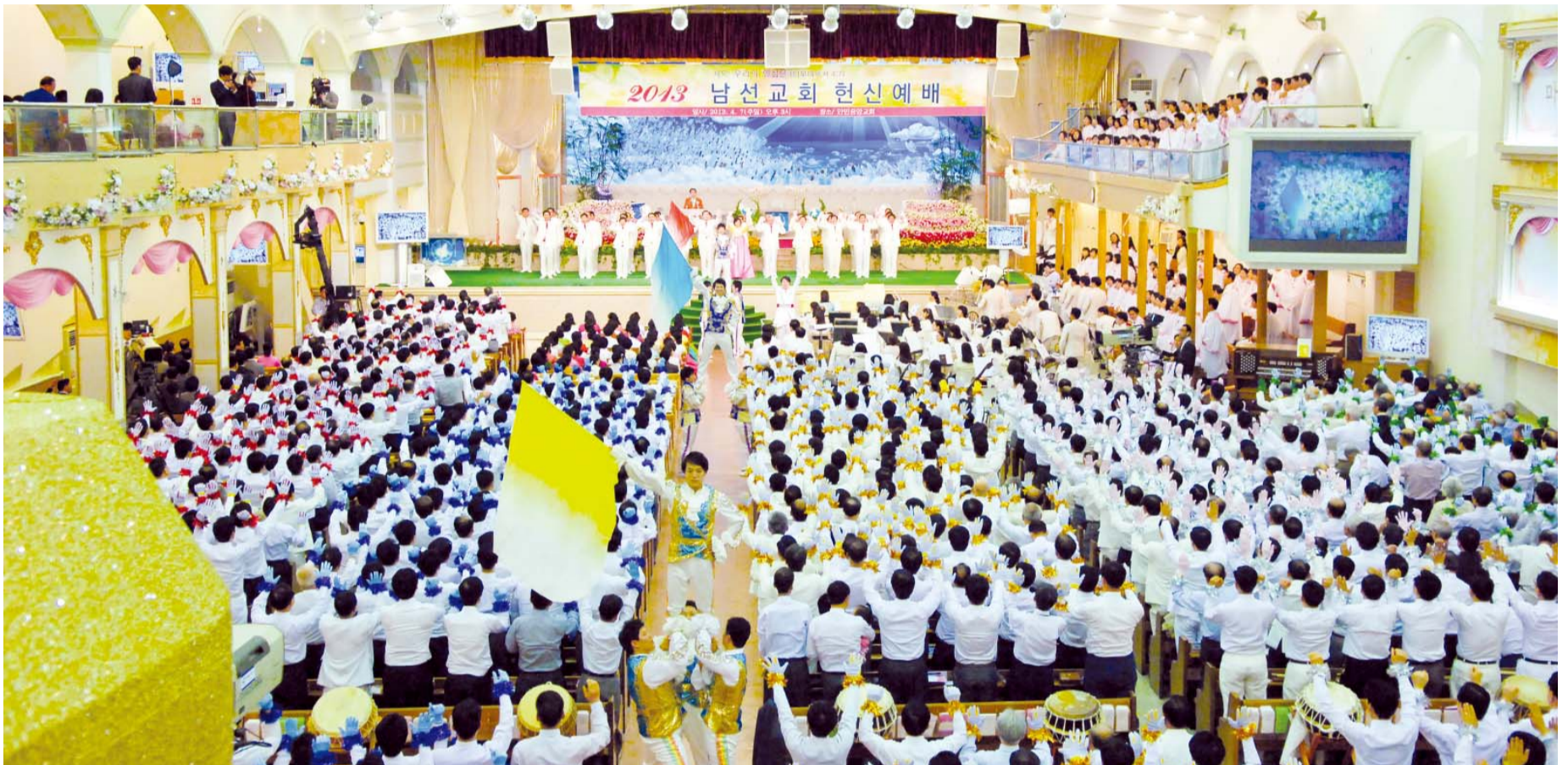
Men's Mission members' special performance during the service. They give out the light of the truth as if they were missionaries dispatched to their workplaces and local communities. They are arming themselves with the Word and offering earnest prayer to enter the best dwelling place in Heaven.

On April 7, 2013, a powerful song sung by Men's Mission members was resounding in the main sanctuary of Manmin Central Church during Sunday Evening Service. Together with loud beats on the drums and dressed in white shirts, red ties, and gloves that were red, yellow, and blue, they offered up special praise with the song "Let Us Go Forth". They were full of pure fervor towards the Lord.