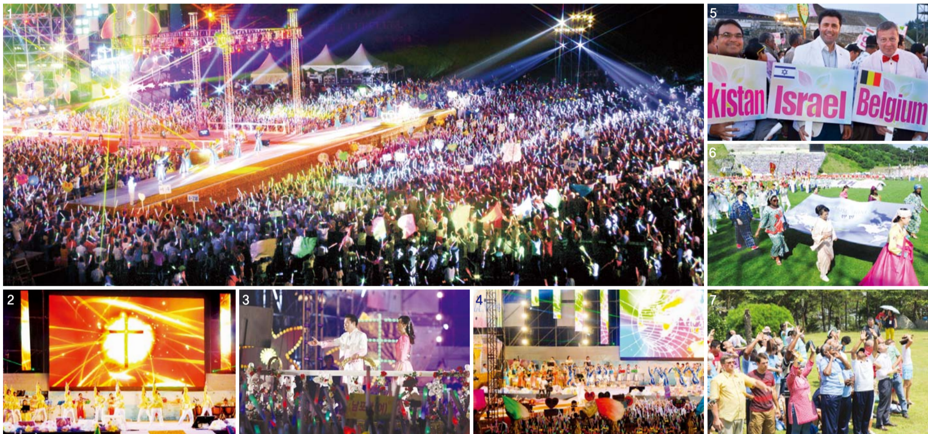
Signs and wonders overflowed in 2013 Manmin Summer Retreat. The pastors and church members from overseas came to have a higher level of faith by experiencing the power of the Spirit and made precious memories of the love shared with the members in Korea. Day 2 , 2013 Manmin Field Day (6) Day 3 , Camp Fire Worship Event in Jumping Park in Deogyusan Resort in Muju, Jeonbuk Province (1-5) Day 4 , Muan Sweet Water Site (7)

More than 500 pastors and believers from 22 countries join in the Manmin Summer Retreat