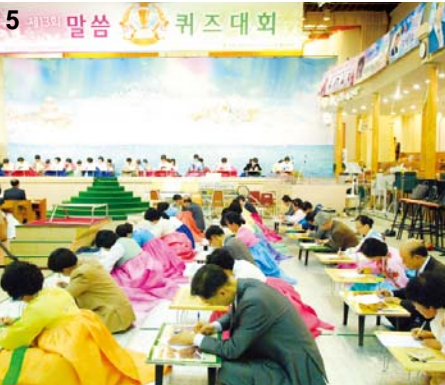
All the prize winners of the 12 contests competed in 'The Best of the Best' Bible Quiz Contest in November 2012 ( Photo 1 ). Just like them, the 13<sup>th</sup> contest was also full of the church members' fervor for the Word of God. Photo 2 : The quick pop quiz in the final round Photo 3 : The cheering for the contestants Photo 4 : Award Ceremony Photo 5 : The contestants answering the questions in a written form

The 13<sup>th</sup> Bible Quiz Contest was held by Men's Mission in the main sanctuary of Manmin Central Church. A month earlier, the contest had preliminary competitions in which 4,208 members participated. The final contest was broadcast live via the Internet and was attended by 57 pastors and members who had made it through the preliminary contests.