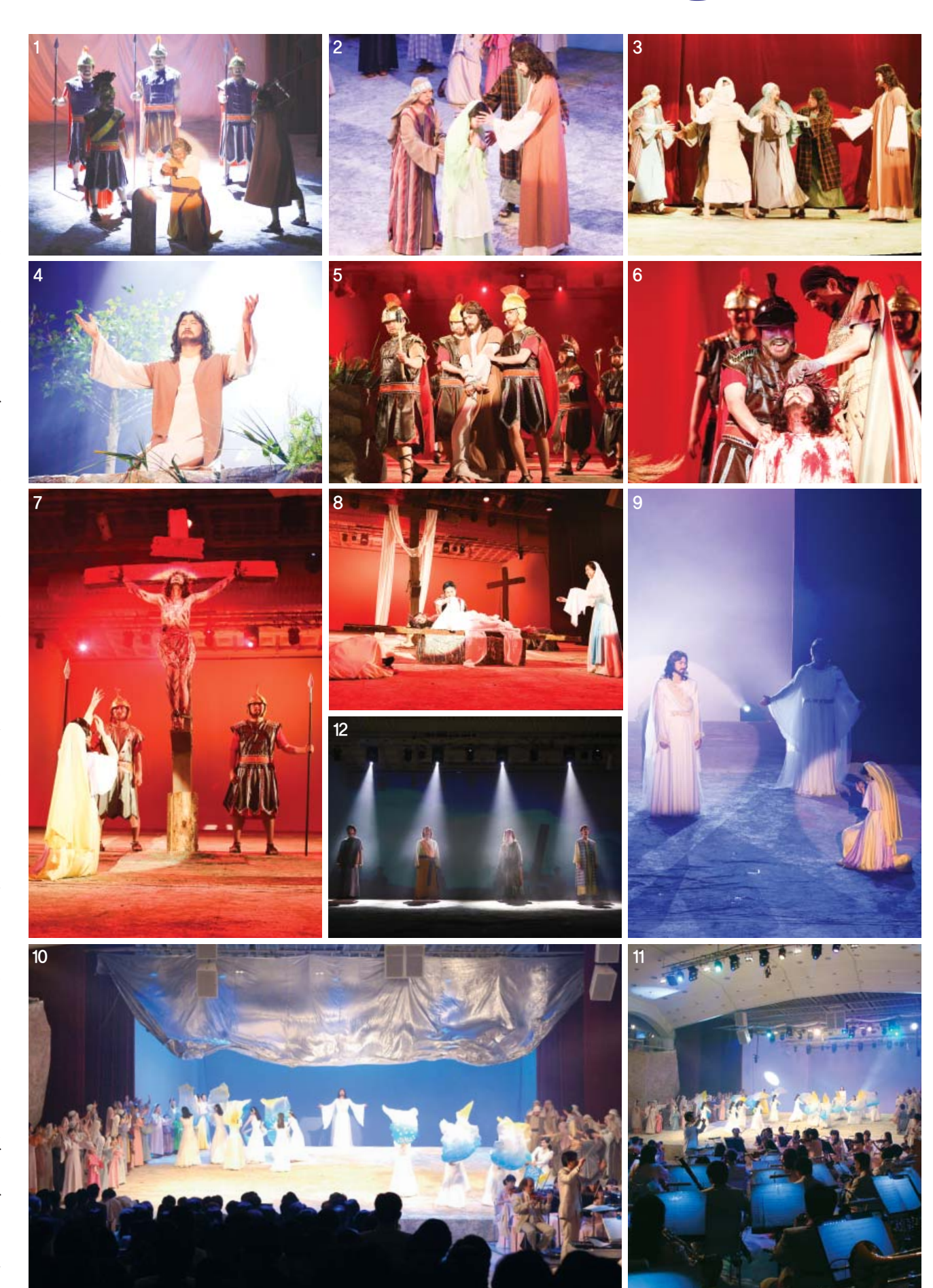
In order to fulfill His duty as the Savior, Jesus came to the earth, preached the gospel of the kingdom of heaven, healed every kind of diseases and all infirmities, died on the cross, overcame death, resurrected, and ascended into heaven. Picture 1: Apostle Paul, being beheaded, Pics 2 &3: Jesus opening a blind man's eyes and reviving the dead Lazarus, Pic. 4: Jesus' prayer on Gethsemane, Pics. 5 & 6: Jesus suffering from soldiers and wearing a thorny crown, Pic. 7: Jesus' Crucifixion, Pic. 8: Joseph from Arimathea shrouding the body of the dead Jesus, Pics. 9-11: The Lord's resurrection and ascension, Pic. 12: The disciples going the way of the Lord

The church members inside and outside of Korea were able to watch together via live broadcast by GCN (www.gcntv.org). They said they felt the Lord's ardent love from their hearts and made up their minds to live like the apostles who took the way of martyrs. They are expected to preach the holiness gospel and God's powerful works to all people of all nations with the shepherd at this end time.