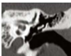
◀ After prayer chronic otitis media with cholesteatoma disappeared, and ear drum and the auditory ossicles are in the right places