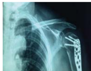
◀ Before prayer: She had an orthopedic plate due to multiple fractures