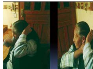
◀ After prayer: She recovered the mobility of her arms. Now she can comb her hair for herself