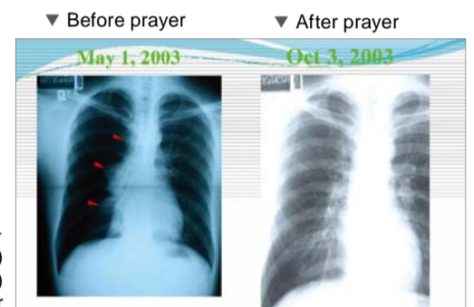
▶ The big pneumothorax in lung (left) disappeared completely (right) after the prayer