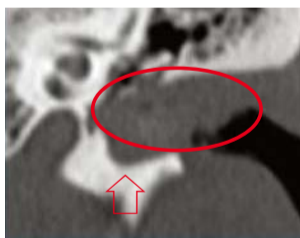
◀ Before prayer chronic otitis media with cholesteatoma in the external auditory (circle), which causes bones under the external auditory canal to erode (arrow) and pushes the ear drum and the auditory ossicles inward