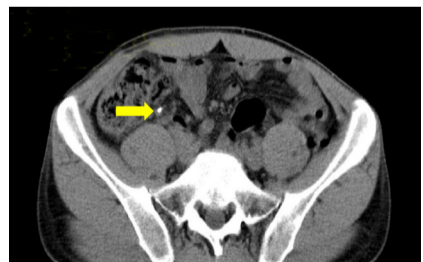
After prayer, normal appendix