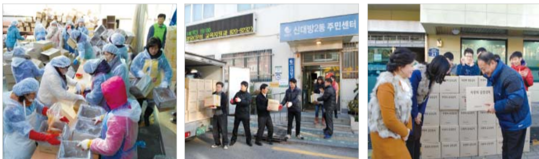
“Do you want some kimchi made with love?” Women’s Mission members made kimchi with joy and shared it with the neglected in love. Love becomes greater when we share.

Manmin Central Church has been practicing the Lord’s love and service. The church has provided child head-of-households and the elderly who live alone with some living expenses, rice, and some side dishes every month. Students in need have also been given scholarship money as well. Every winter before Christmas church members gather to make kimchi and share it with neighbors in need, thereby delivering the warm love of the Lord.