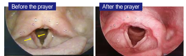
▲ Right vocal cord nodules with rubefaction ▲ No vocal cord nodules

I give all thanks and glory to God who blessed me to undergo a precious trial and gain true happiness as His child.