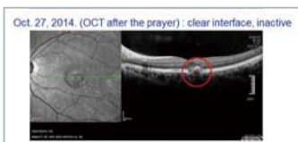
▶ After the prayer: clear interface, inactive

"On the doorstep of death he survived heart failure with pulmonary edema"