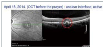
◀ Before the prayer: unclear interface, active