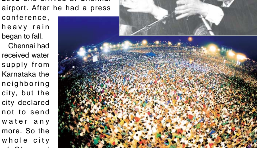
India United Crusade 2002 was attended by a total of more than three million people. During the period of the crusade, severe drought was relieved. Many people were healed and converted to Christianity.

water supply problems on October 9. But for a week while Dr. Lee stayed in India, there was frequent rainfall with large amount of water accumulation.