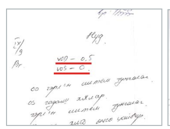
Before the prayer Right: 0.5 / Left: 0

Now I even can read books. I feel like I was dreaming. Thank You, God!