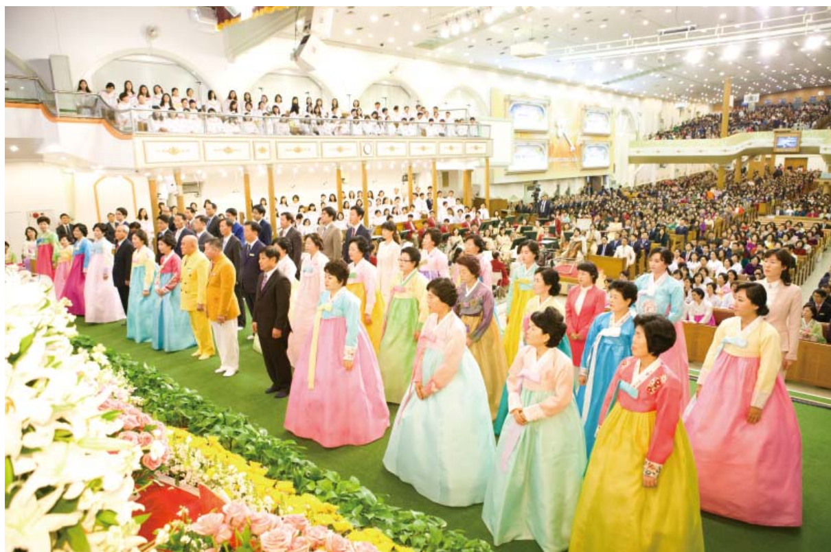
There were 44 awardees who worked faithfully with joy and thanks in 2015 as members of the Lord's body: 4 district leaders, 3 sub-district leaders, 4 cell leaders in parishes; 1 group leader and 4 small group leaders in missions; 6 committee members; 4 volunteer group members; 13 full-time workers, and 5 volunteers.