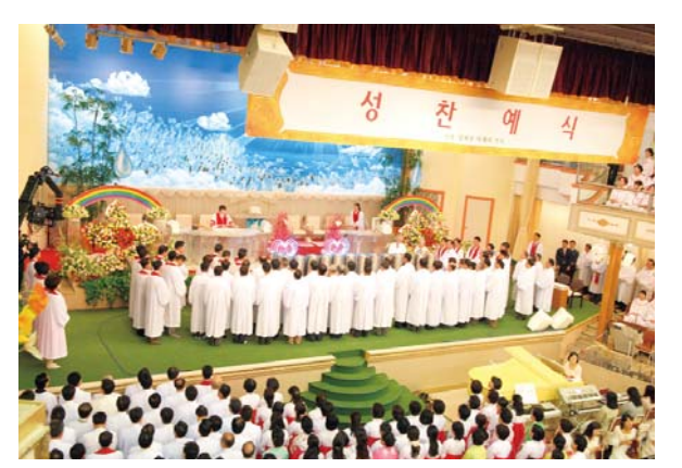
Easter Sunday Holy Communion 201

Easter is one of the three major Christian feasts, and 'resurrection' means that even dead people who were saved will be transformed into resurrected body when the Lord comes again and live forever (Refer to page 3).