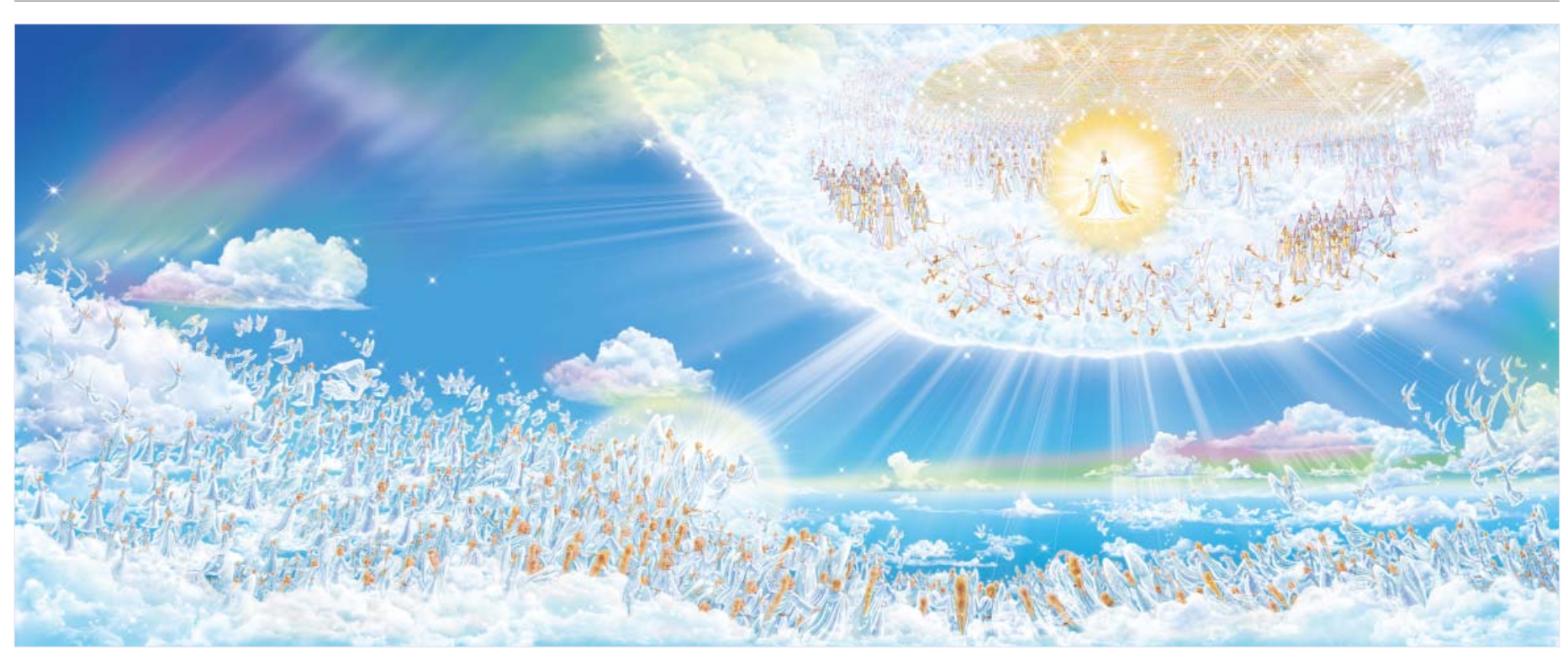
The Lord who comes in the air and the believers who put on the resurrected body

Manmin News NO. 485 APRIL 3, 2016 FEATURE STORY