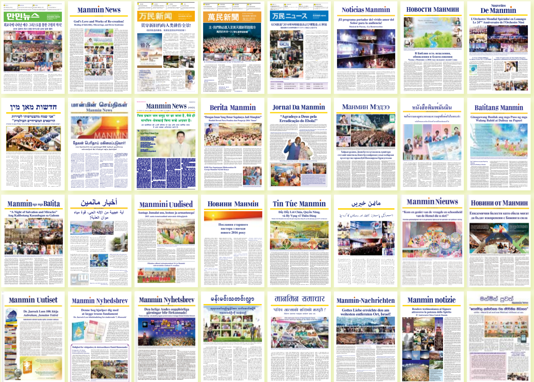
Manmin News published in 32 languages

Manmin News has spread the power of God the Creator, the gospel of Jesus Christ, and the works of the Holy Spirit to the ends of the earth and led all people of all nations to the way of salvation. This year Manmin News celebrated its 29th anniversary.