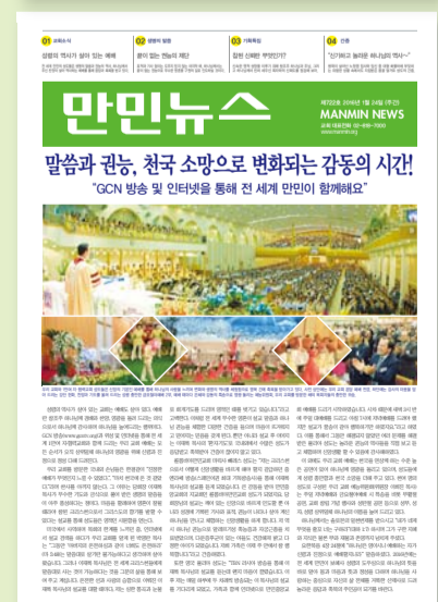
No. 722 of Korean Edition, January 24, 2016