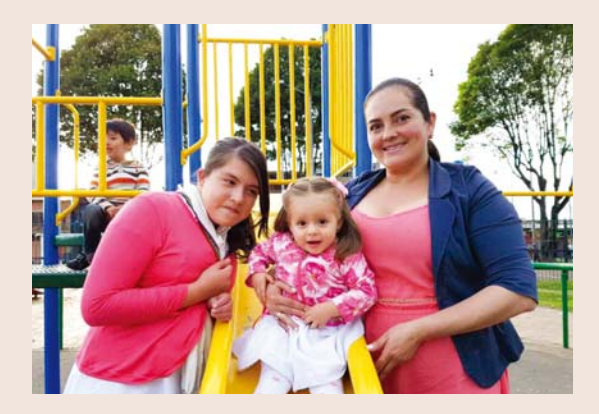
Before the prayer