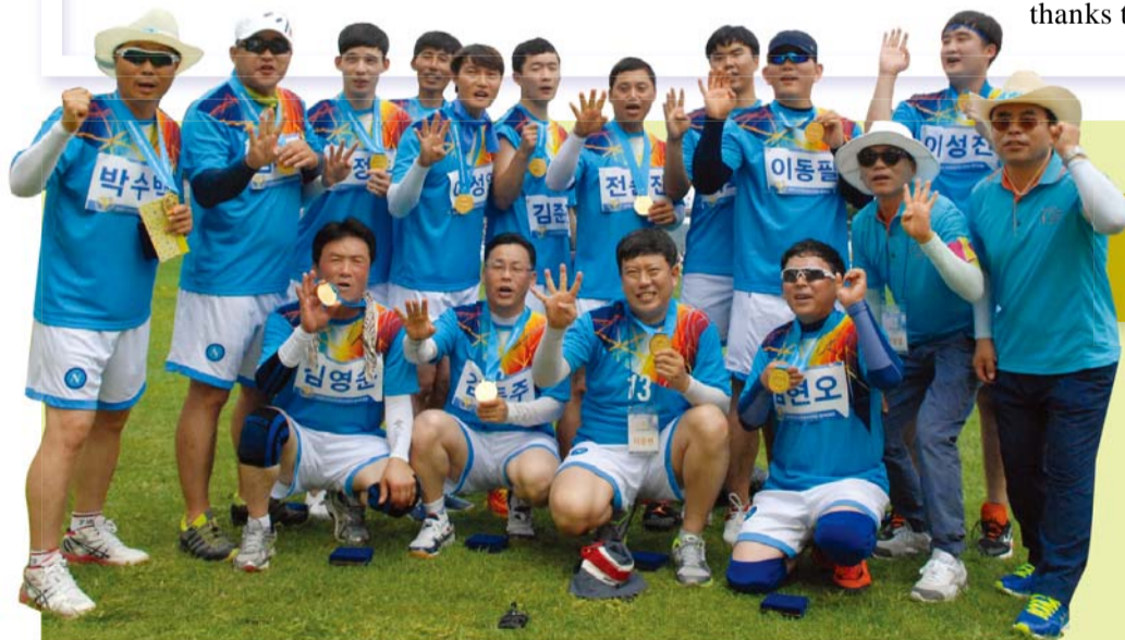
Branch Churches’ Team, four consecutive gold medals in Volleyball Match

When I received the baton, my body felt very light as though I had never hurt and while running I was assured that I was healed. I entered the finish line with my both hands up and said “Hallelujah! Father, thank You!” I give thanks to God who healed me and to Senior Pastor who prayed for me.