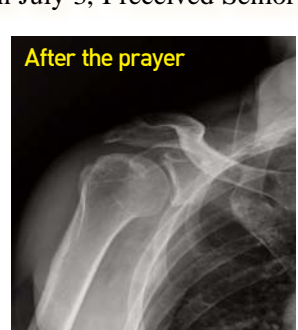
The fractured parts of greater tuberosity of humerus were rejoined to their places as if they had been joined through the surgery and the dislocated bone was also in its place.