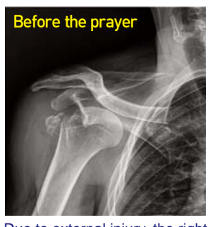
Due to external injury, the right shoulder joint was dislocated and greater tuberosity of humerus was broken into small pieces.

Pastor's prayer when he came back to the church from the mountain prayer house. I felt cool and comfortable during the prayer. In the evening, I took off the protective support and came to live normally. Hallelujah!