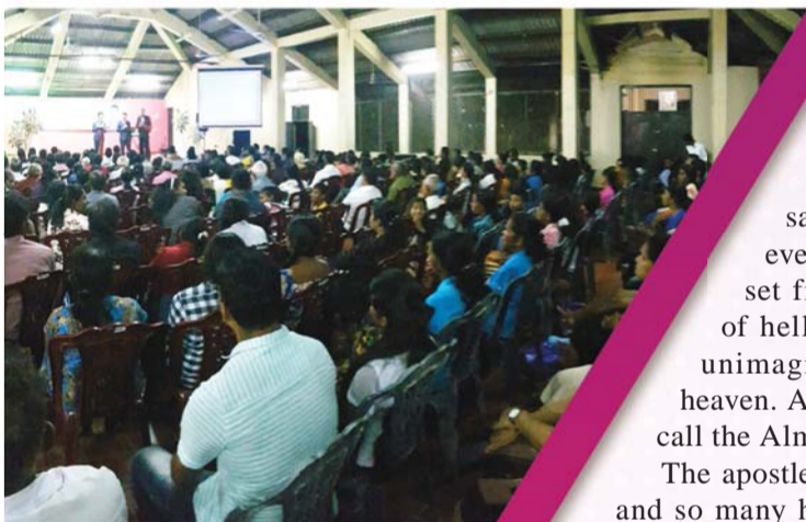
▼ Egypt Pastors' Seminar (December 1)