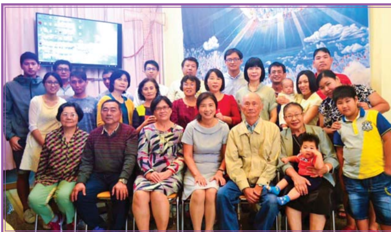
Xin Zhan Manmin Church in Taiwan

Moreover, we used to offer up the service in my house but now we have a sanctuary because God had given my members financial blessings. I have been renewed by the word of life, and many healing works and blessings have overflowed in my church. I am a really blessed pastor. Hallelujah!