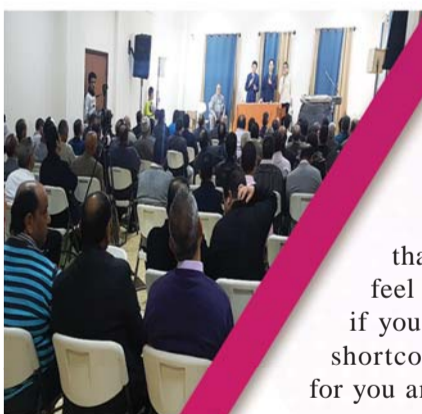
▼ Egypt Handkerchief Healing Meeting (December 2)