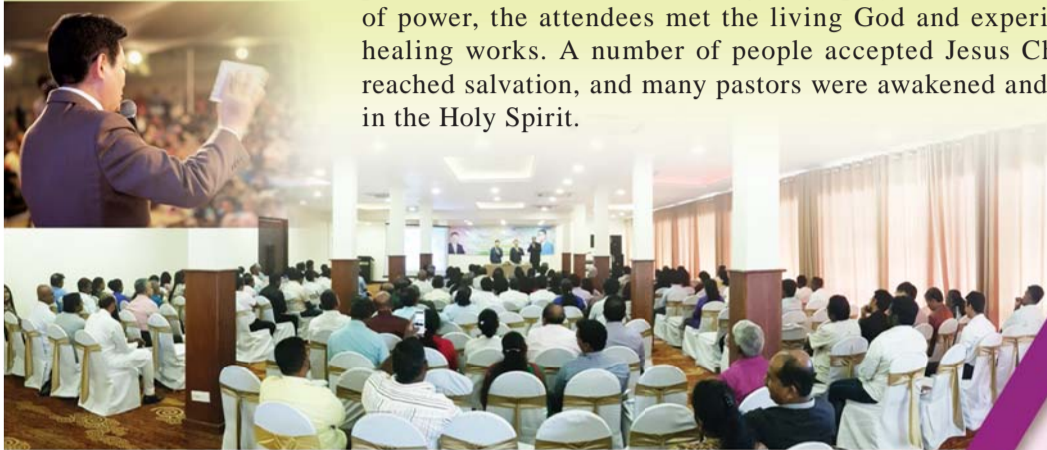
▲ Sri Lanka Pastors' Seminar (November 28)