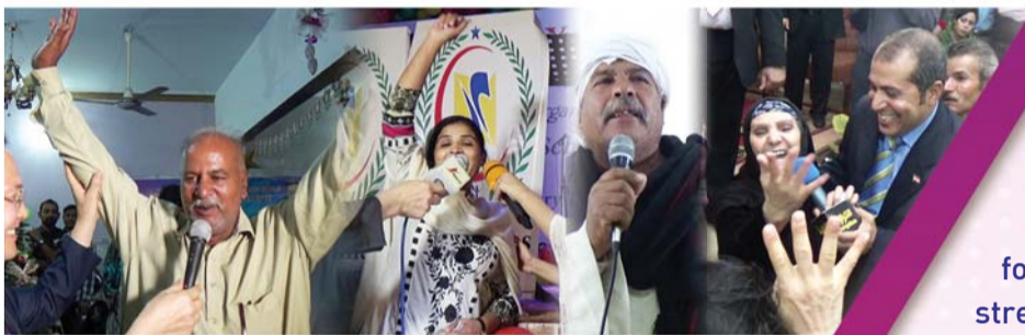
▼ Sri Lanka Handkerchief Healing Meeting (November 29)