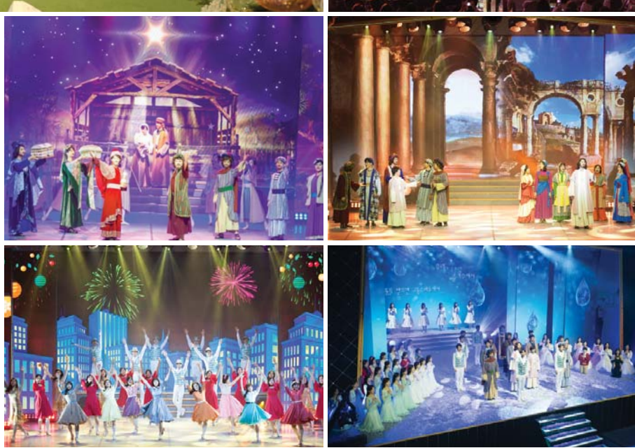
and "December 25". The performers sang, danced and acted with fervent passion. Together this all added intense emotional inclusion of the people in attendance.

On the 24th the Christmas Eve Performance was presented after Sunday Evening Service by the Performing Arts Committee under the title "Congratulations on the Lord's Birth!". It was in a contemporary genre showing a variety of live performances unfolding with a video story, fantastic special lighting, and beautiful music and dance in harmony. The video story-line was enhanced by new songs of Manmin Praise such as "The Lord's Birth", "Great Mystery", "The Way of Salvation", "Power of Love",