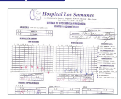
Before prayer: an exam in 2008 shows serious hearing disorder for both ears