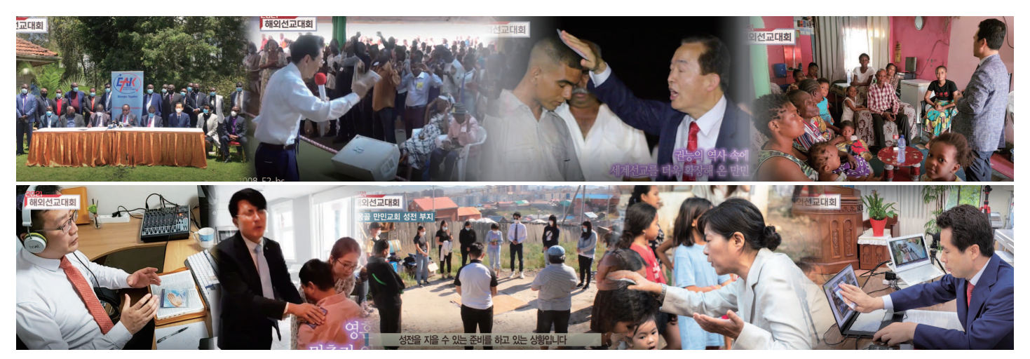
Manmin world mission is being actively carried out through missionaries who dedicate themselves to preaching the gospel of the Lord through the works of the power and the holiness gospel. (from the video "the 2021 Overseas Mission").