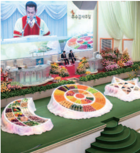
2020 Thanksgiving Day decoration on the altar